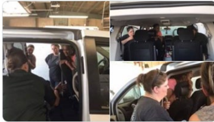
TN Highway Patrol