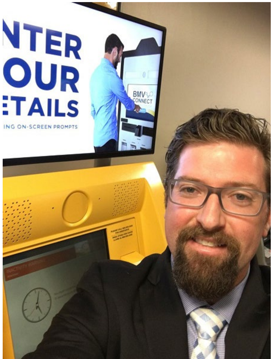
Michigan State Police @MichStatePolice | View the Tweet