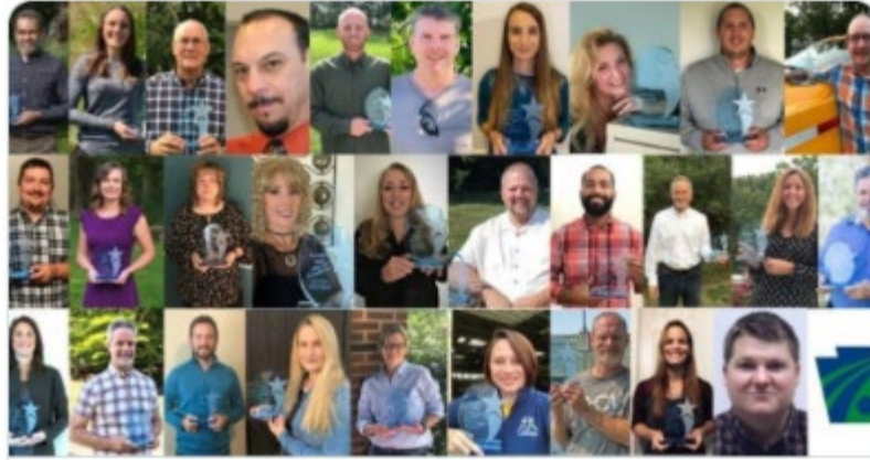
PennDOT honors its 2020 Stars of Excellence virtually Each year PennDOT recognizes select employees for their outstanding performance with a Star of Excellence Award, the agency's highest honor. penndot.gov