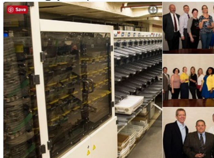
DMV received three awards from @AAMVAConnection for customer convenience and service, fraud prevention and detection, and improved efficiency. The projects,