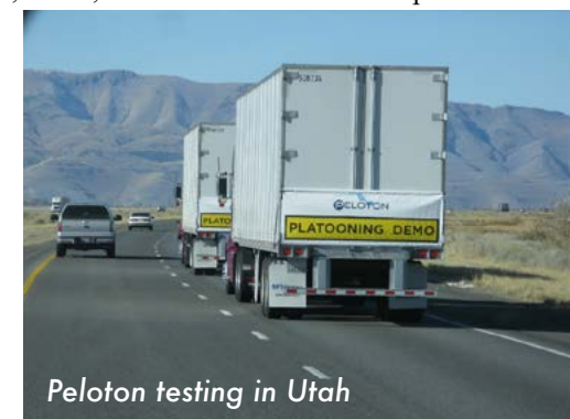
Peloton testing in Utah

Much media attention has been focused on Google’s autonomous vehicle efforts. Google has been testing their autonomous vehicles in closed courses and public streets for about seven years. They currently have almost 60 vehicles operating in Mountain View, California; Austin, Texas; Kirkland, Washington; and Phoenix, Arizona. Their stated intent is to offer a fully autonomous vehicle to the public by 2020, essentially entering the market at Level 4 or 5 automation. But, nearly all of the traditional automakers are also developing automated features, and have offered certain features on some of their models. Their approach is more incremental, and includes connected and automated features, but is often focused on a fully autonomous vehicle as the end point. In mid-August, 2016, Ford announced that it plans to mass produce self-driving cars, with no steering wheels or pedals, and have them in commercial operation in a ridehailing service by 2021. Google also recently announced a partnership with Fiat Chrysler to transform some 2017 Chrysler Pacifica minivans into self-driving vehicles. In September 2016, UBER and Volvo began to deploy self-driving ride-sharing vehicles in downtown Pittsburgh. The Volvo vehicles have a person behind the wheel to take over in case the system fails to operate properly.