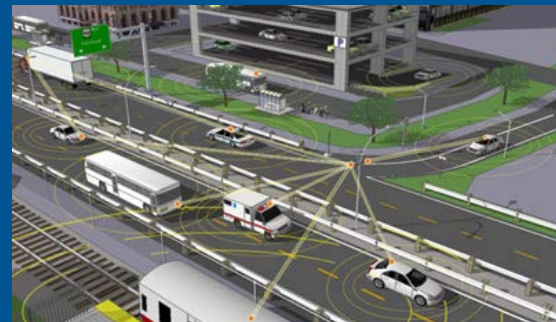
Connected vehicle communications

How do they work together? For example, an autonomous vehicle “sees” that a traffic signal is red, yellow, or green through its digital camera systems; however, it does not know when that signal might change. A connected vehicle likely knows whether a signal is red, yellow or green, and also knows when it will change, because that information is broadcast by the signal system. If the automated sensor is obscured by another vehicle or sun glare or bad weather, the message received by the connected system would still know the condition of the traffic signal.