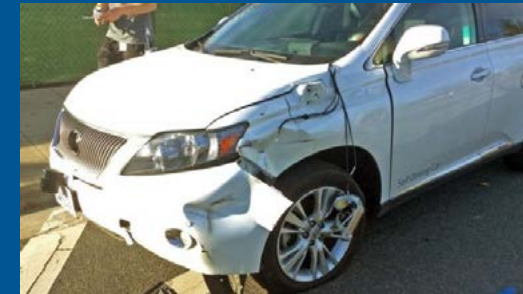
Google car crash February 2016.

According to NHTSA research, 94 percent of vehicle crashes are caused by human error. Autonomous vehicles represent a tremendous opportunity to decrease the number of crashes on our roads and potentially eliminate thousands of fatalities each year; however, recent high-profile crashes involving autonomous vehicles illustrate risks in the process of achieving that goal.