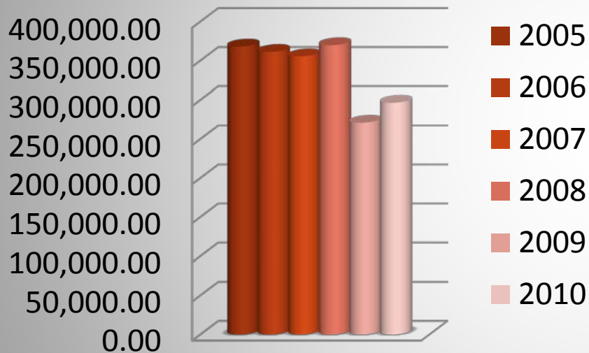
Canadian exports, $ millions