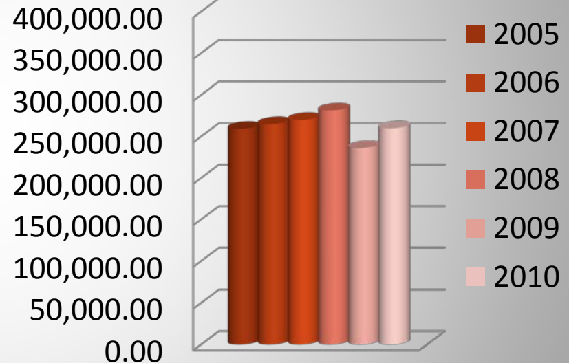
US exports, $ millions