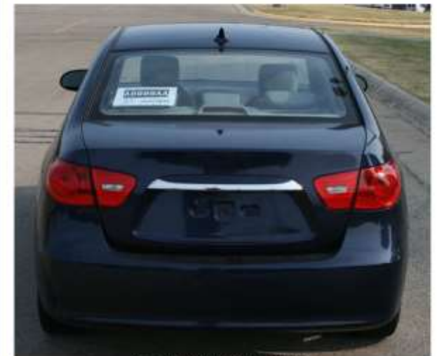
Primary location for temporary plate

Tape the temporary plate inside lower corner of rear window on the driver's side (see example below):