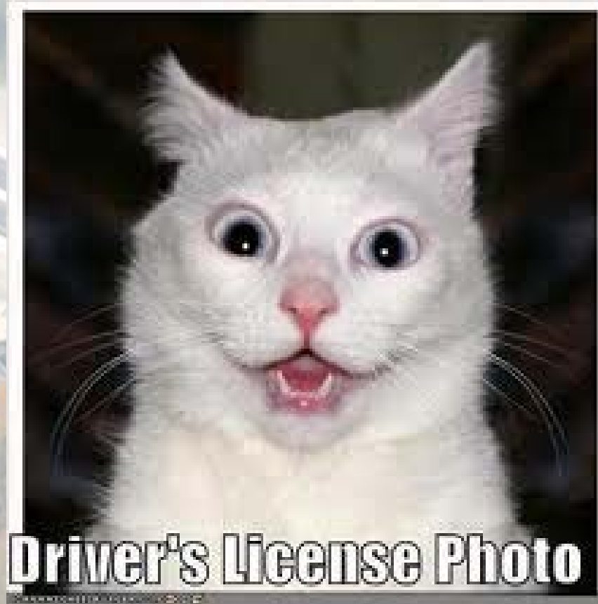
Driver's License Photo