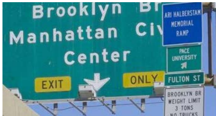
'New York State Gives Official Green Light for Autonomous Vehicle Testing' http://bit.ly/2r5B5Os via @routeifty