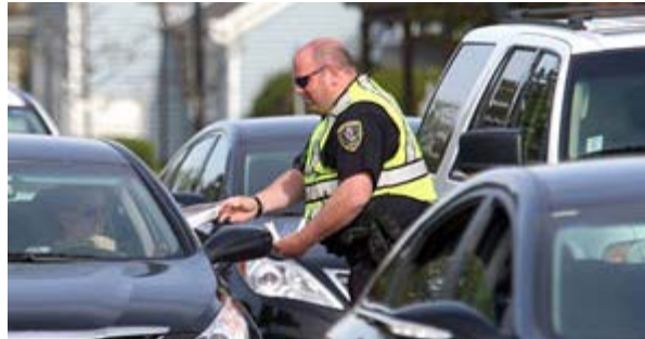
ILLINOIS - How 1 suburban department chose education over enforcement in distracted driving campaign @WDundee