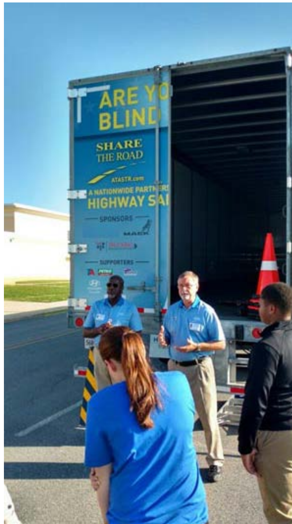
Share the Road professional truck drivers were in Martinsburg, WV this week teaching high school students about highway #safety.