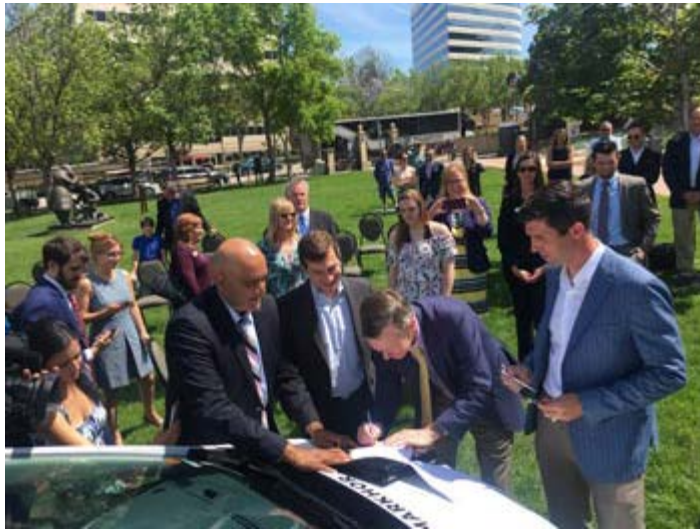
Beautiful CO day to sign SB213- a great starting point for autonomous vehicle regulation! #billsigningtour #2017COLaw